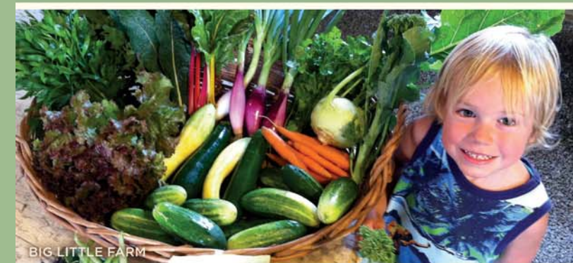
BIG LITTLE FARM