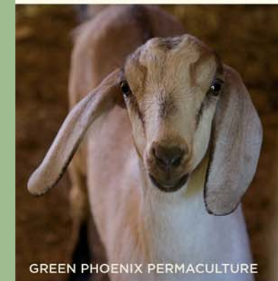
GREEN PHOENIX PERMACULTURE