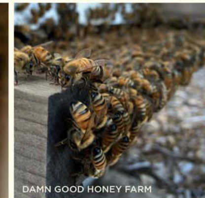
DAMN GOOD HONEY FARM